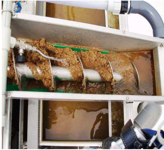
Sand Washer top view showing wash water entering