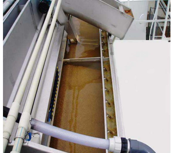
Filter bed top view showing filtered water overflow